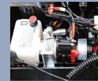
Integrated hydraulic unit, compact structure, less space