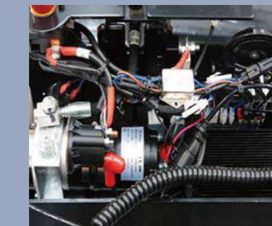
One-piece cover, covering almost all important components, convenient for maintenance