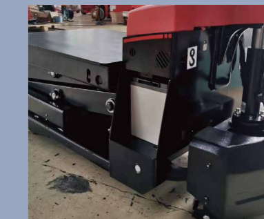
The batteries can be removed conveniently, for easier maintenance and disassembly