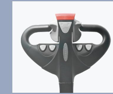
Multi-function handle, reliable, beautiful and simple, all functions can be completed with one hand.